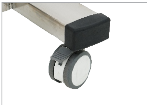
CASTOR Equipped with 3" castors for easy mobility during use