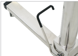
HI - LO ADJUSTER Equipped with height adjustments to adjust user comfort