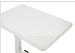
TABLE Stainless steel table, durable, and easy to clean