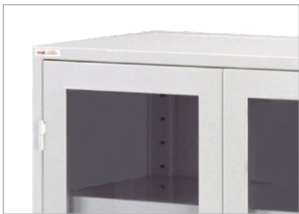
TRANSPARENT GLASS Fully transparent door cupboard section provide excellent looks.