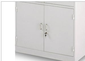
COMPARTMENTS With bottom compartment system enable patient saving shoes, sandals etc.