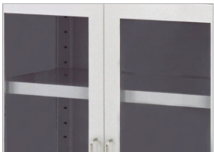
ADJUSTABLE SHELVES With adjustable shelves system enable adjusting it's shelves.