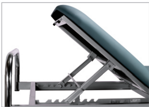
BACK-REST Adjustable padded backrest to provide patient comfort in treatment procedures