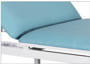
MATTRESS Wide mattress covered with synthetic leather, easy to clean