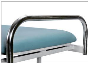
HANDLE Made of stainless steel, ergonomic and rigid