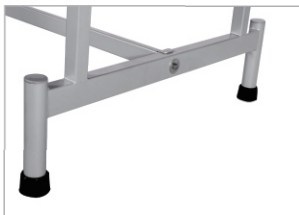
FOOT PAD Prevent scratches or damaged on foot frame