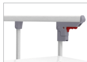
COLLAPSIBLE SIDE GUARD Side guard locking system with one touch locking mechanism to ensure patient safety.