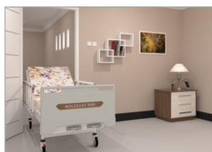
SMALL WIDTH Suitable for narrow space.