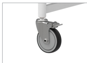
CASTOR 5" castors with brakes.