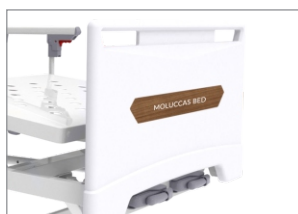
PANEL The head and foot end panel are easy to clean, lightweight and designed with self-locking system for easy assembly and disassembly.