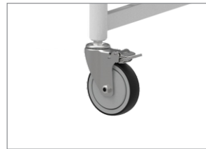
CASTOR 5" castors with brakes.