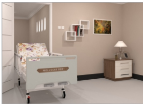
SMALL WIDTH Suitable for narrow space.