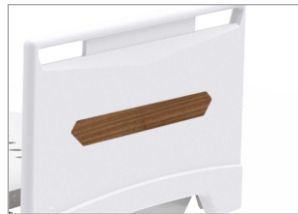
PANEL The head and foot end panel are easy to clean, lightweight and designed with self-locking system for easy assembly and disassembly.