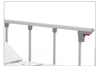
COLLAPSIBLE SIDE GUARD Side guard locking system with one touch locking mechanism to ensure patient safety.