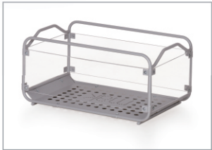
CRADLE Acrylic with a quality steel pipe frame, creates a more modern appearance and is safe for babies