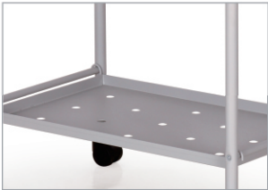
ACCESSORIES TRAY There is a place to put baby equipment and accessories