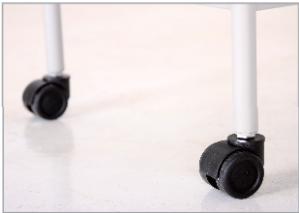
CASTOR Makes it easy to move the bed