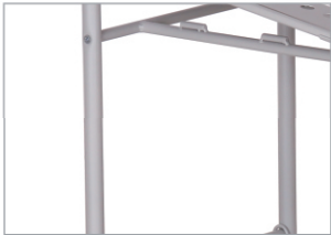
FRAME Safe design for babies