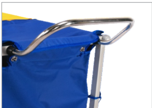
HANDLE Equipped with excellent stainless steel section handle.