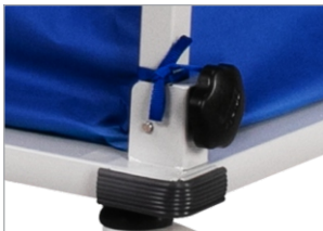
KNOCK DOWN Optimal for storage and saves space.