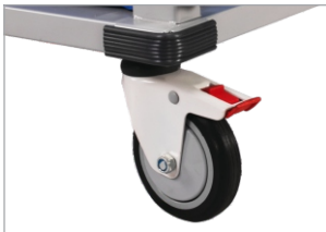
CASTOR Giving smooth product moving fitted 5" swivel castor wheels.