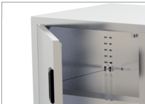
SHELVE Provide freedom for users in organizing linen storage