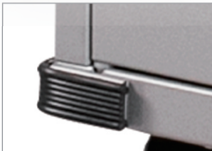
BUMPER Each corner is equipped with a bumper which functions to protect the trolley from impacts