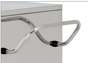
HANDLE Equipped with a stainless steel push handle