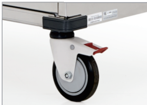
CASTOR Equipped with 5 inch castors to make trolley movement easier